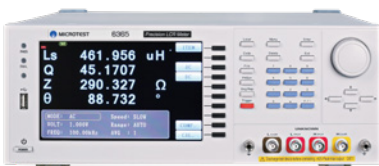
6363 / 6364 / 6365 / 6366 / 6367 / 6365A / 6365B